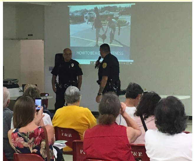
HPD gives tips on how to be a good witness.