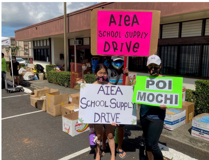
Volunteers at last year's Aiea Complex School Supply Drive at Timothy's Church, July 2021.

Aiea High School PTSO is a 501(c)(3) non-profit organization contributions are tax-deductible