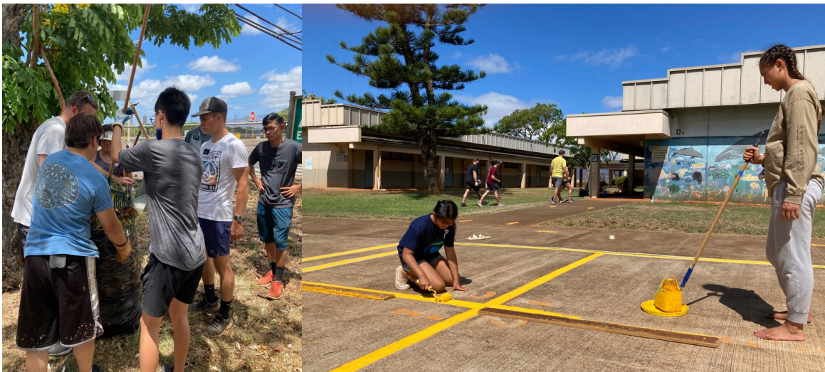
As part of last year's Community Day in Our Schools, volunteers pitched in to help beautify public school campuses in District 16, July 2021.