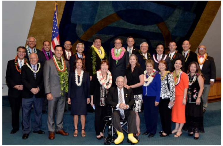
Hawai'i State Senators on the floor of the Senate chambers on the last day of the regular 2016 Legislative Session.

To view the full text of the bills, go to the Legislative website: http://www.capitol.hawaii.gov/