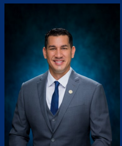
STATE SENATOR KAIALI'I KAHELE HILO