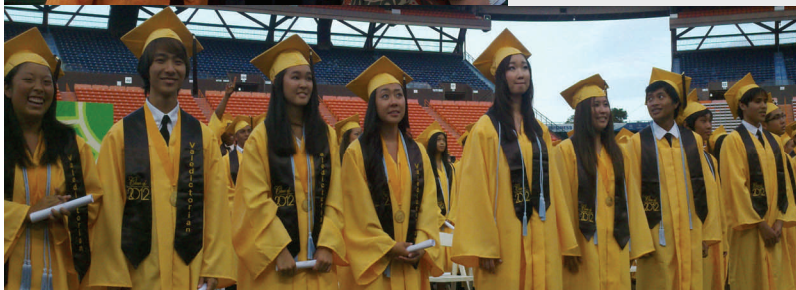
Some of the 16 Valedictorians (4.0 or better grade point) of the graduating class of MHS.

Congratulations! MHS was the first high school state-wide to hold commencement this year on Sunday, May 13th (Mother's Day) at Aloha Stadium. Of the 598 graduates, 87% are planning to go to college.