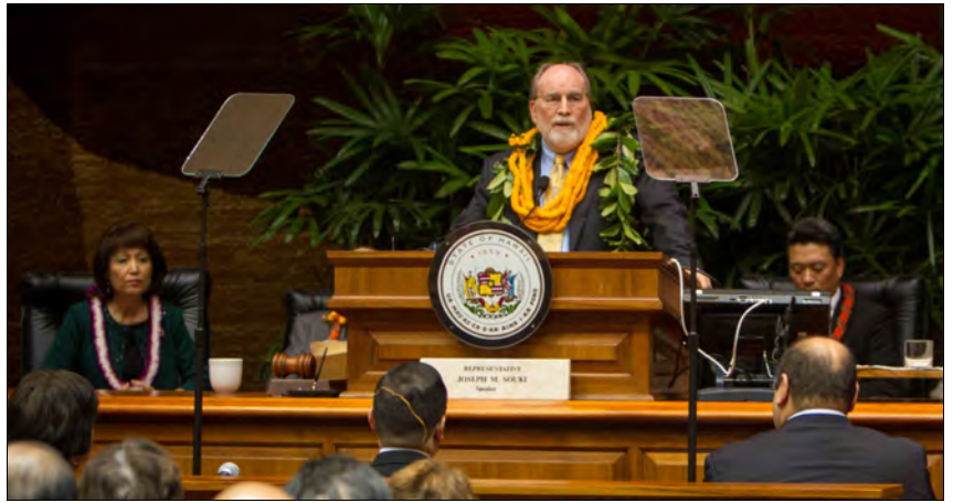
Governor Abercrombie ~ State of the State Address, Tuesday, January 21

House Speaker Souki - protect the environment, reform the tax system . . . Look beyond your own well being, and beyond today's needs.