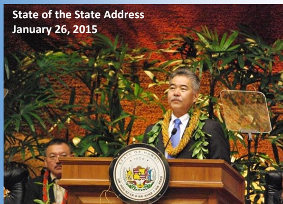
State of the State Address January 26, 2015