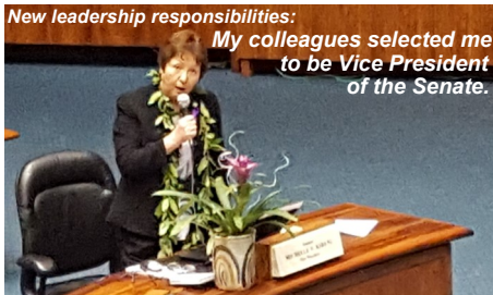
New leadership responsibilities: My colleagues selected me to be Vice President of the Senate.