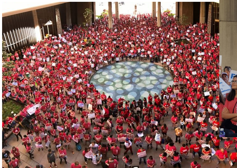
Hawaii's public school teachers held a huge rally for support in February. HSTA designated me "Lawmaker our Keiki Deserve."