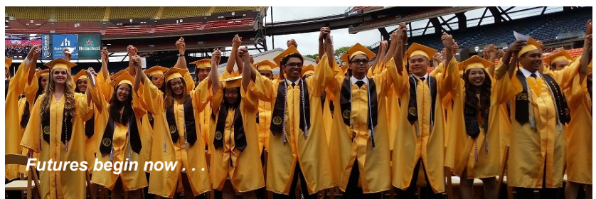
Futures begin now . . .