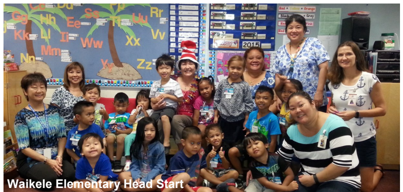
Waikele Elementary Head Start