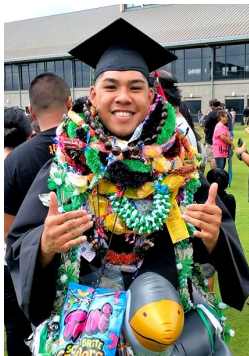
Smiling faces & jubilant families – all building hopes and dreams. Scenes from the Spring UH West Oahu commencement ceremony when more than 300 graduates received diplomas & certificates. The campus continues to grow as a point of pride for our central and leeward Oahu communities.