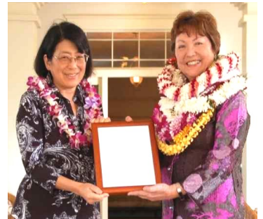
The remarkable success of Waipahu High School's Early College program allowed a dozen members of the Marauder Class of 2018 to receive their Associate in Arts degrees from Leeward Community College BEFORE they received their high school diplomas. Great work, everyone!