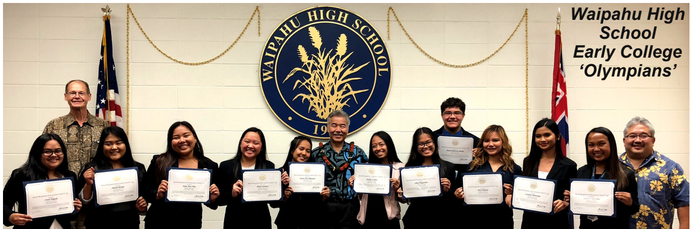
Waipahu High School Early College 'Olympians'