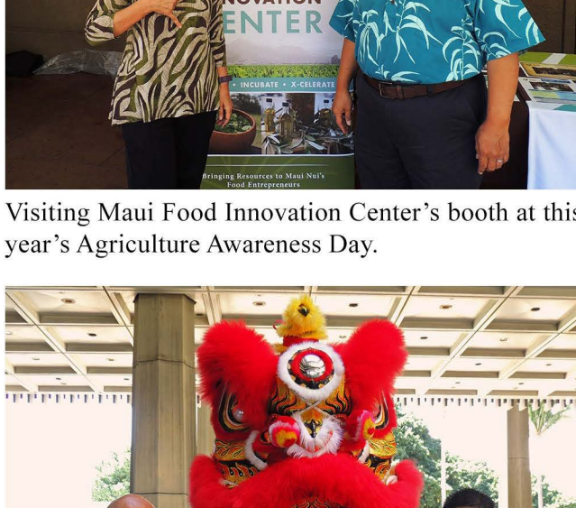
Visiting Maui Food Innovation Center's booth at this year's Agriculture Awareness Day.