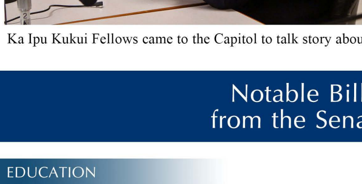
Ka Ipu Kukui Fellows came to the Capitol to talk story about current issues and legislation that affects the Valley Isle.