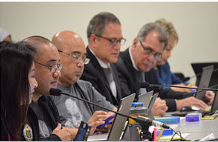
First day of Conference Meetings on Budget Bill HB1900 HD1 SD2.