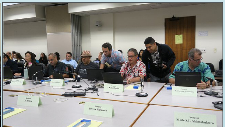
Closing the Budget Bill during Conference Meeting on April 20, 2018.