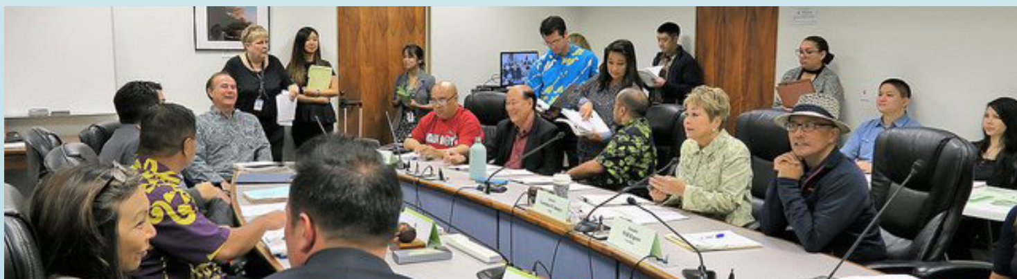
Deliberations during the final day of Conference on April 27, 2018.

Requires health care providers in the workers' compensation system authorized to prescribe opioids to adopt and maintain policies for informed consent to opioid therapy in circumstances that carry elevated risk of dependency.