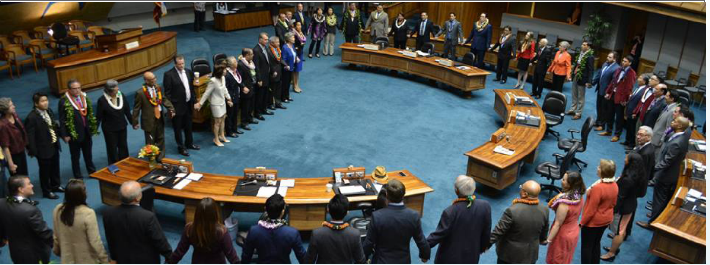
Senators and Representatives singing "Hawai'i Aloha" at Sine Die on May 3, 2018.