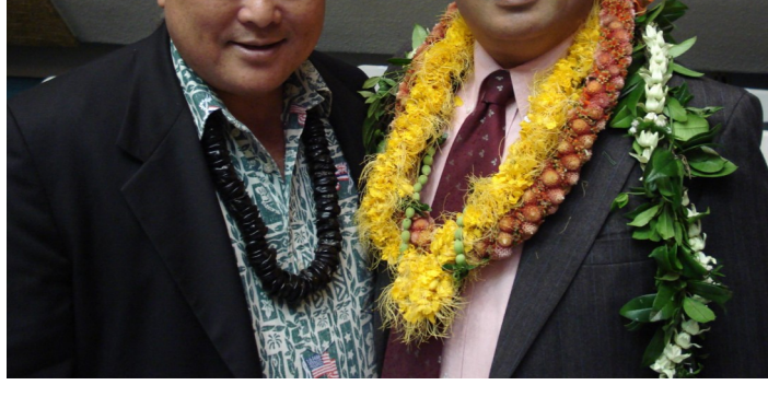
Maui Mayor Alan Arakawa and Senator Keith-Agaran on Opening Day.