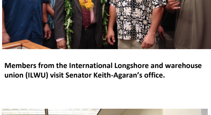
Members of the International Longshore and warehouse union (ILWU) visit Senator Keith-Agaran's office.