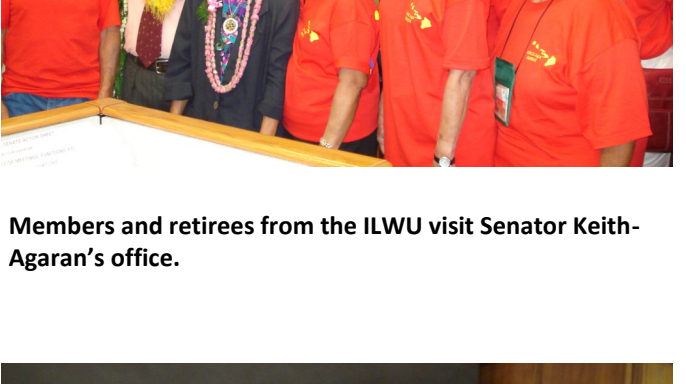
Members and retirees from the ILWU visit Senator Keith-Agaran's office.