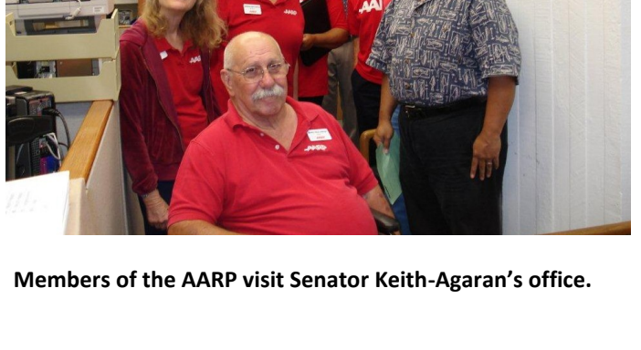
Members of the AARP visit Senator Keith-Agaran's office.