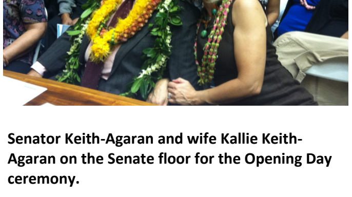
Senator Keith-Agaran and wife Kallie Keith-Agaran on the Senate floor for the Opening Day ceremony.