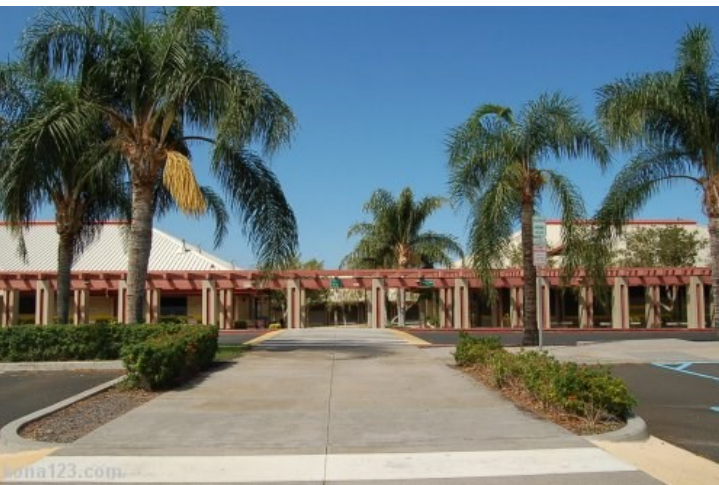
Waikoloa Elementary and Middle School

Honokaa High and Intermediate School (HHIS) was founded in 1889 and is located directly across the street from the Elementary School. Besides the community of Honokaa, HHIS serves students from as far as Kawaihae, some 20 miles away. The student population has only one three-stall restroom on the main campus for each gender and a student population of 600. Our CIP request is to provide funding for the construction of additional multi-stall restrooms in the auditorium building.