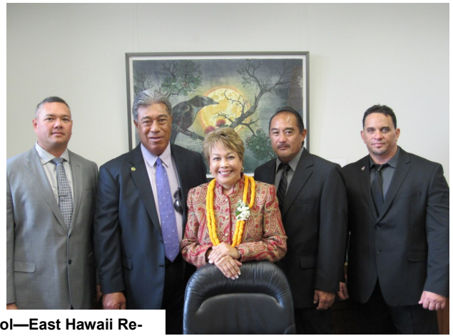
Clockwise: Visitors to the Capitol—East Hawaii Region of HHSC board and staff and HMC Foundation; Operating Engineers representatives, Mokupuni O Keawe Homestead Alliance and Representatives from HSTA.