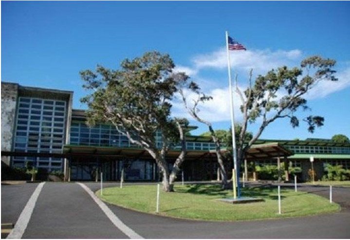
Laupahoehoe Community Public Charter School

CIP requests were submitted to benefit three schools in our district.