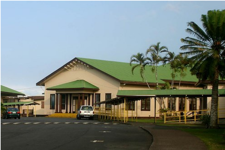
Honokaa High and Intermediate School

Laupahoehoe School, originally founded in 1904, became a Community Public Charter School in 2012. The leadership team is implementing a community vision for their students. Our CIP proposal is asking for construction and equipment funding for four projects—the creation of a school farm, the furnishing of a technology and video lab, the construction of an outdoor learning environment and the purchase of more classroom furniture.