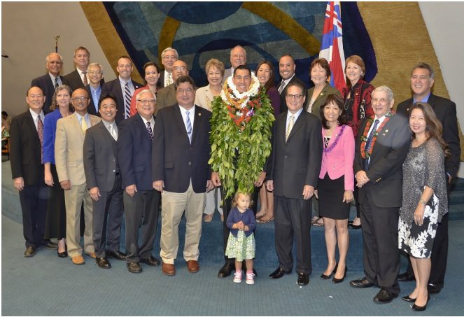
The Senate welcomes Senator Kaiali'i Kahele to the Capitol.

In 2016, there are 14 Senate Committees: