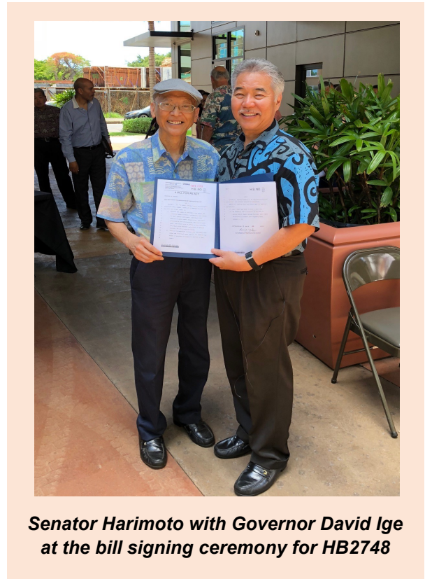
Senator Harimoto with Governor David Ige at the bill signing ceremony for HB2748

(SB2027): Appropriates $1.5 million to continue and improve the statewide homeless initiative to prevent homelessness and rehouse homeless people in the state.