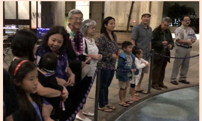
Senator Harimoto with his family at the 2017 PurpleLight event honoring survivors and remembering those lost in the battle with pancreatic cancer.