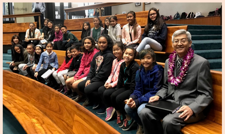
Senator Harimoto with Student Council Members from Waimalu Elementary School

(HB1895): Makes it unlawful for a person under the age of 21 to possess any tobacco product or electronic smoking device.