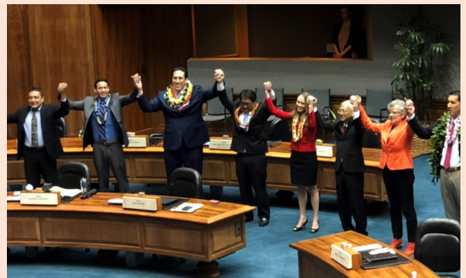
Senate and House members gathered together in the Senate Chambers to sing Hawaii Aloha to adjourn the 2018 Legislative Session.