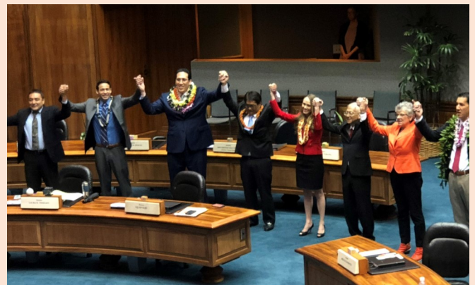
Senate and House members gathered together in the Senate Chambers to sing Hawaii Aloha to adjourn the 2018 Legislative Session.