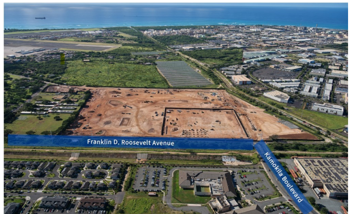
Roosevelt Ave./ Kamokila Construction, March 2022

Down the street, construction has been underway at the future site of the VA (ALOHA) Clinic near the intersection of Kamokila Blvd. and Franklin D. Roosevelt (FDR) Ave. Work has begun on the building's foundation and nearby road construction continues in the area. Crews have completed most of the new underground electrical system and have started work on the FDR Ave. roadway drainage system. Additional road closures may be required in the coming months as Hunt Companies works to expand FDR Ave. from a 2-lane roadway to a 4-lane traffic pattern. Hunt's construction team has safety top of mind and continues to work diligently with engineers and respective government agencies to develop a plan to safely construct the new FDR Ave. and Kamokila Blvd. intersection. Any changes to road closures or construction will be announced as they become available. (Continued on p. 4)