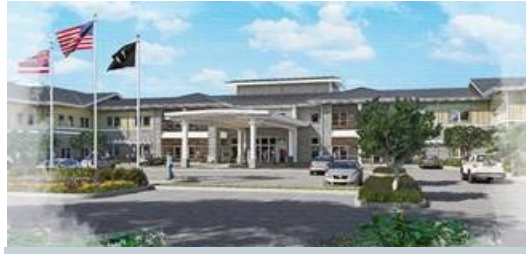
Pictured: street view rendering, courtesy of MGA

grant from the U.S. Department of Veterans Affairs and received $53.7 million in state funds for planning, design, construction and equipment.