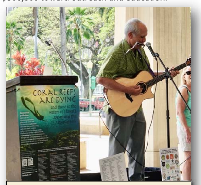
Sen. Gabbard wrote and performed a song for the "International Year of the Reef" sunscreen rally at the Capitol Rotunda on April 18.

Four bills I authored this session passed the Legislature. As the Agriculture and Environment Committee Chair, I helped to shepherd through the landmark bill (SB 3095) making Hawai'i first in the nation to ban chlorpyrifos (chlor-peer-ifos), a toxic pesticide particularly harmful to children and pregnant women. The bill also includes restricted use pesticide reporting, a pesticide drift study at three schools, and a 100 ft. pesticide buffer zone around all public schools. The bill will increase the cap of the Pesticide Use Revolving Fund from $250,000 to $1 million for pesticide training, creates two new positions in the Department of Ag, and puts $300,000 toward outreach and education.