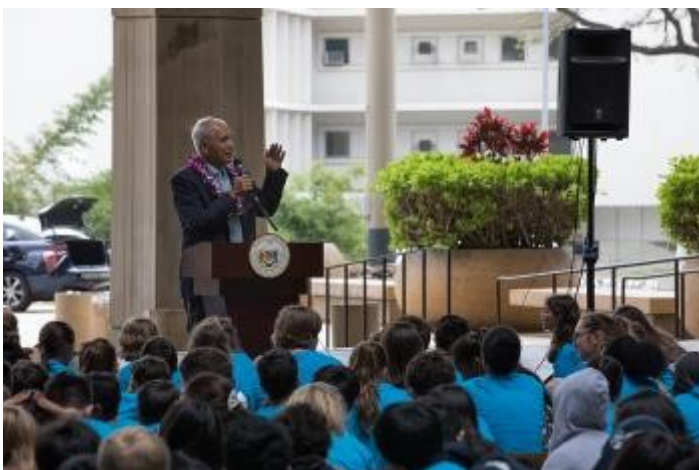
Sen. Gabbard spoke to hundreds of students from Island Pacific Academy at the State Capitol for Blue Planet Foundation's Clean Energy Day on April 20.

On April 20, I spoke to over 600 students gathered at the State Capitol for Clean Energy Day. Their energy was electric! (pun intended) I thanked the students for their interest and commitment to clean energy transportation and their enthusiasm in helping reach the state's goal of 100% renewable energy by 2045. I also updated the students on the state's progress toward that goal: 26% renewable energy this year, up from 9% renewable energy in 2009. The event was hosted by Blue Planet Foundation and featured activities and displays on clean and renewable energy technologies. One of the highlights of the event: a display and test drive of several different electric vehicles. I've been driving an electric vehicle – a Nissan Leaf – since 2011, but couldn't resist checking out the newest line of vehicles.