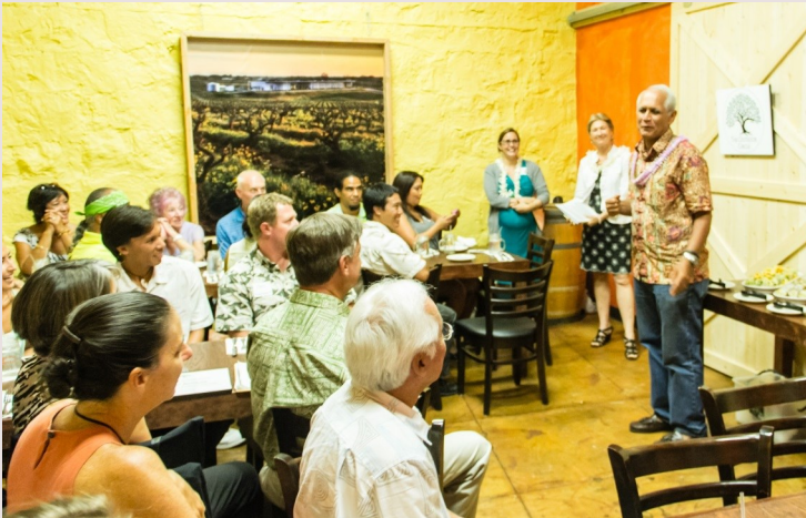
Sen. Gabbard attended a luncheon and spoke at the "Outdoor Circle Celebration Party" for the Passage of SB 632, establishing environmental courts, on July 25, 2014.