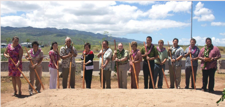
Sen. Gabbard attended and gave a few remarks at the East Kapolei II Groundbreaking Ceremony on July 30, 2014. This new Hawaiian home- stead community will be the future home to 160 native Hawaiians.