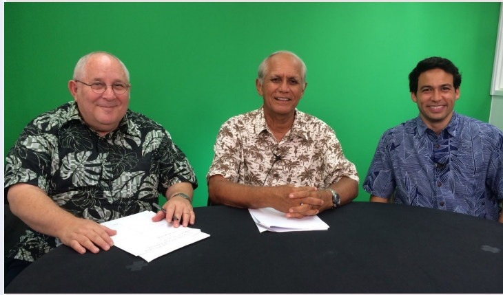
Sen. Gabbard, along with Rep. Chris Lee, at ThinkTech Studios with host Jay Fidell on July 30, 2014, discussed "Clean Energy Legislation."

I was appointed last month to a Task Force which will study the effects of the January 2014 fuel tank leak at the Red Hill Underground Fuel Storage Tank Facility. We'll also be hearing from the Navy on their plans to keep this from happening again. The Task Force was created by SCR 73, which passed the Legislature during 2014 Session. As you might remember, 27,000 gallons of fuel leaked from one of the 20 giant underground tanks, each the size of a 20-story building. The tanks are capable of holding 12.5 million gallons of fuel. This facility is a critical part of our defense system. But at the same time, it's very important that major changes be made to lessen the dangers that these tanks pose to our drinking water supply.