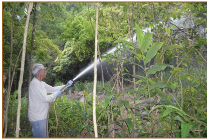
Senator Gabbard sprayed an area of thick foliage on Maui with citric acid to control the spread of coqui frogs on May 20th.