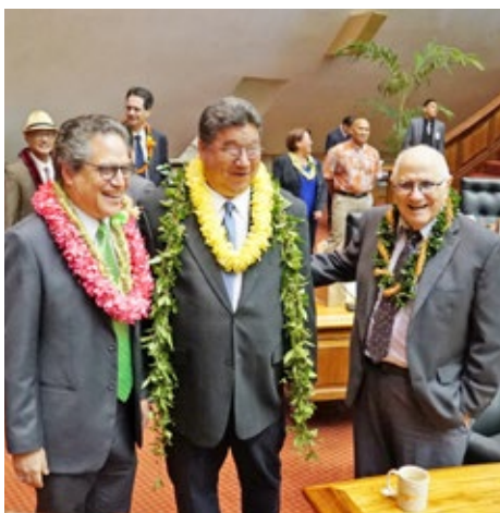
Vol.16 • Issue 7 • pg.2 • May 15, 2016

The Hawaii Senate Majority 2016 Legislative Program can be viewed on the website: www.hawaiisenatemajority.com