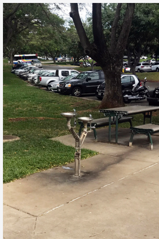
AFTER: repaired fountain

According to a concerned constituent, a water fountain at Kapiolani Community College (KCC) has been leaking for over a year—the individual had been trying to resolve this issue for that long. Given that this fountain lies on land owned by the State of Hawai'i under the Department of Land and Natural Resources, adjacent to the KCC parking lot, and was installed by the City, there were jurisdiction issues as to who is responsible for it. With the help of KCC, the City and County of Honolulu, and DLNR, the fountain was fixed by the first week of March and now offers a safe, convenient place to refresh oneself.