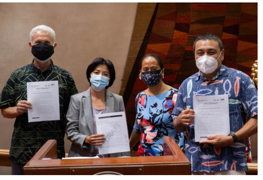
Introducing bills for consideration this session.

In this newsletter, I share details about a selection of bills I introduced, and others currently being considered by the Legislature. You can learn more about these measures and all the bills being considered at the Legislature through the State Capitol website, <u>capitol.hawaii.gov</u>. The Capitol website allows you to track bills, watch hearings streaming online, and offer written or live virtual testimony in committee hearings.