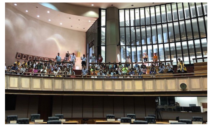
Over 200 participants from the Taiwan Chambers of Commerce North America visited the Capitol.

Building hours: 7am. to 5pm, Monday - Friday Photo ID is required for entry into the building