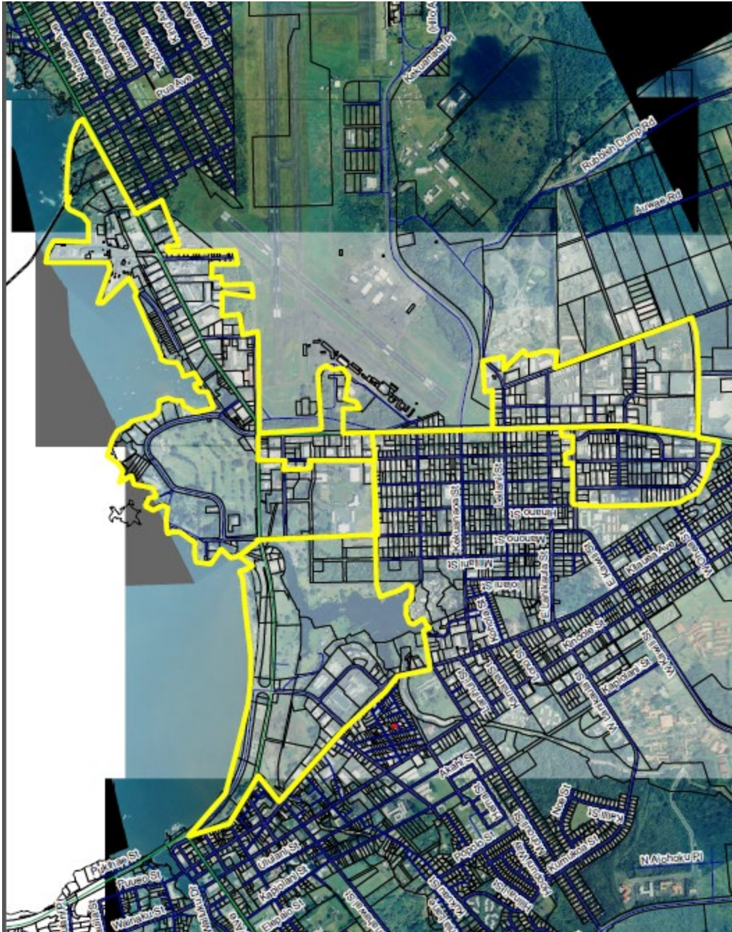
Hilo Community Economic District under Act 149, Session Laws of Hawaii 2018