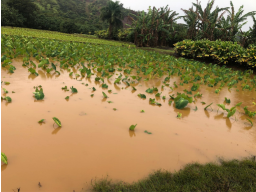
This is my lo'i on 2/19/2021

hurdles to obtain a long-term water lease. Our community is resilient and committed to this work but, we need your kōkua — and the ability to directly negotiate — to continue our efforts in earnest. Please act today to pass this resolution.