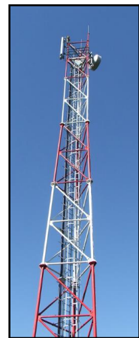
3G cellular tower

5G networks use a higher frequency than 3G or 4G networks and are planned to be much faster and more reliable. The higher frequency uses shorter RF energy waves called millimeter waves. These millimeter waves are weaker than 3G or 4G at traveling long distances and cannot easily move through walls, buildings, and other physical obstacles. Because of this, to complete the 5G network and keep cell service strong and fast, many small antennae are required to provide adequate cellular coverage in an area. These antennae will likely be placed on homes, buildings, and other structures. It is expected that the addition of these 5G antennae will increase the environmental exposure to RF energy. However, these increased exposures are likely to be less than from your personal cell phone and RF energy levels are projected to generally stay below limits set by the Federal Communications Commission (FCC). This increased exposure to RF energy from 5G networks is not expected to cause direct health effects. More research is needed to further our understanding of the effects of 5G networks.