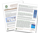
Hawaii State Department of Health 5G Fact Sheet (PDF)