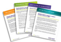
EMF Information Packet (PDF)

EMF information packets are available to our customers and employees at no cost. In addition, Hawaiian Electric provides a free home survey of EMF to residential customers upon request. To request a hard copy of Hawaiian Electric's EMF information packet be delivered to your home, or to request a home survey, please call (808) 543-7511. Commercial customers who are interested in learning more about EMF at their business should contact Occupational Safety and Health Administration (OSHA) at (808) 586-9110.