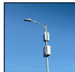
5G cellular antenna on a street light.