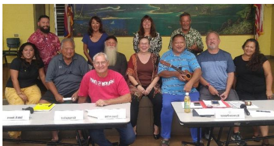
North Shore Neighborhood Board