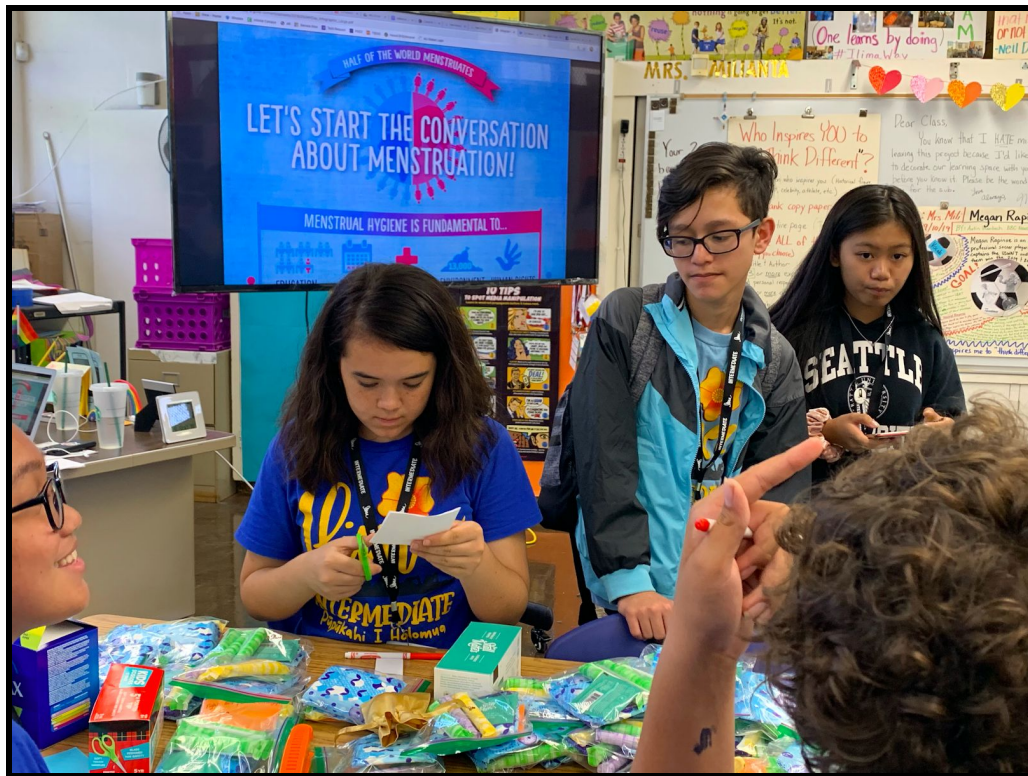
(Students creating "menstruation station care packs" with tampons, pads, and wipes. Fall 2019)

I wrote a grant through DonorsChoose for $350 to stock the first set, but that level of financing on campus is not sustainable for a single teacher, and proves that this needs to be an item provided on campus.