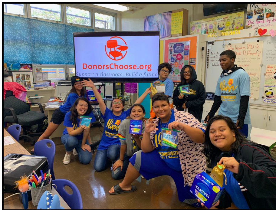
(Students creating “menstruation station care packs” with tampons, pads, and wipes. We crowd funded the supplies through DonorsChoose.org (like “Go Fund Me” for teachers, Fall 2019)