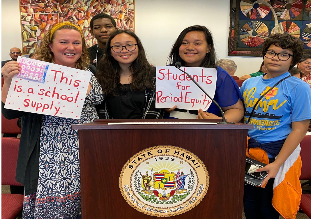
'Ilima Intermediate Students Testifying for Period Equity in Public Schools (House Finance Committee, Feb 2020)