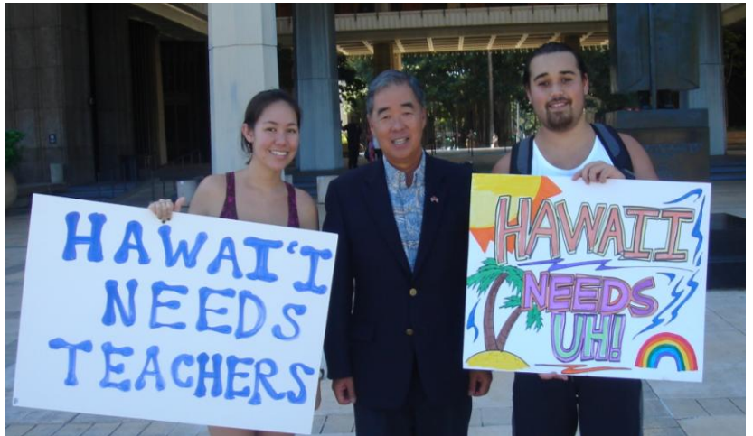
Students voice their concerns over University of Hawaii budget cuts at a rally at the State Capitol