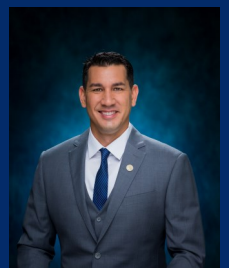
STATE SENATOR KAIALI'I KAHELE HILO