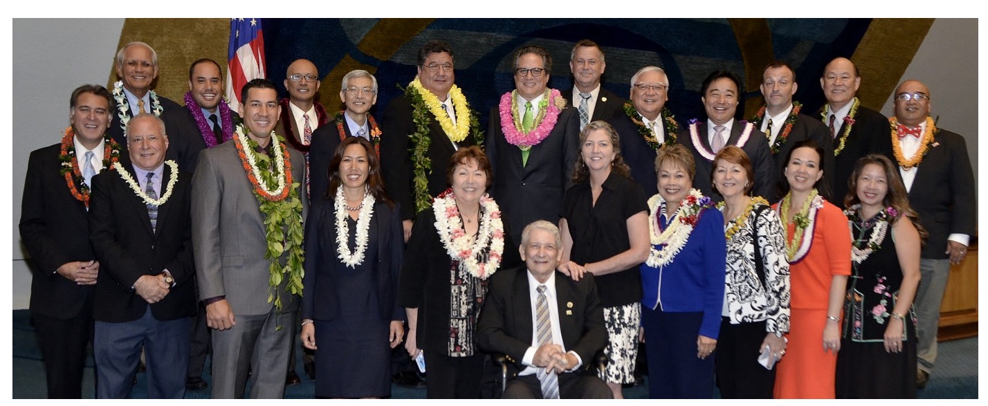
An adjournment-day portrait ~ May 5, 2016.