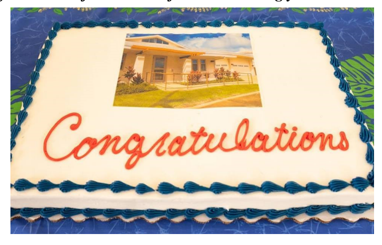
The long-awaited Waipio EMS station is now open for business!