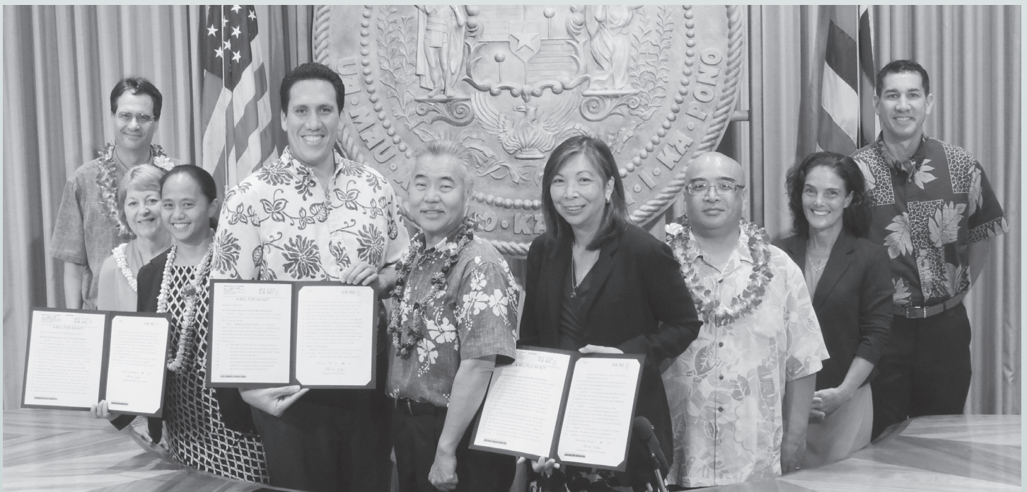
June 25, 2019: Attending the bill signing of HB168, HB1248 and SB216 -- all measures relating to voting and elections.

Requires a mandatory recount of election votes when the difference between two candidates is equal to or less than 100 or one-quarter of 1% of the total number of votes cast, whichever is greater.