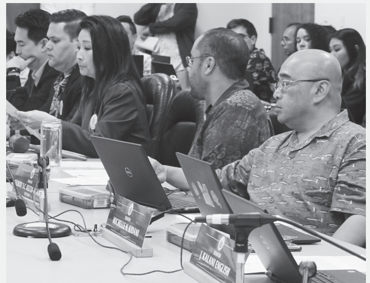
Conference Committee meeting on 3/22/19 regarding Executive Budget (HB2).

Clarifies that lost earnings, mental health treatment, counseling and therapy are eligible for reimbursement to a crime victim as a result of a defendant's offense.