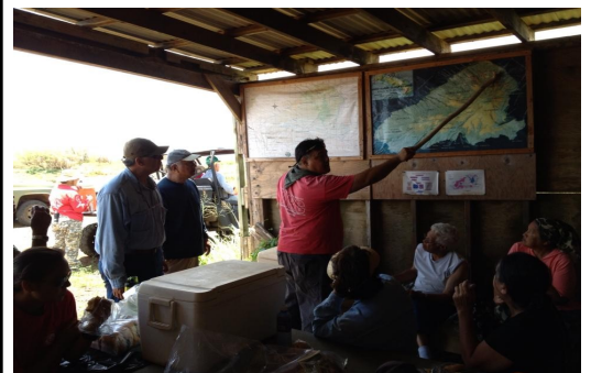
A briefing on the status of the restoration, operations and management of Kaho'olawe was given by KIRC.

The Aha Moku was created by the Legislature and signed into law by Governor Abercrombie through Act 288 on July 9, 2012. The purpose of the Aha Moku is to advise the Chair of the Board of Land and Natural Resources and its department on issues related to land and natural resources management through the aha moku system, a system that is based on the indigenous resource management of moku (regional) boundaries.