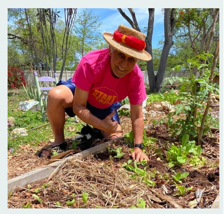
Senator Gabbard plants kale in his family Lanakila (Victory) garden.

safety, and before the health of our natural environment. State and local governments are already shouldering huge fiscal and human costs of environmental damages and will be forced to shoulder increasing costs in decades to come. Ignoring the significant role that federal agencies have in mitigating these impacts through the NEPA process is counterproductive to the state-federal partnership and dangerous to the well-being of the public. The proposed deadline changes for the preparation of Environmental Assessments and Environmental Impact Statements will also make it difficult for states to participate effectively in NEPA processes, as it could take multiple years of data collection to understand long term impacts. This will not only hurt the outcome of the NEPA process and state citizens, it will also directly limit a state's ability to effectively participate in the review process. I urge CEQ to withdraw the National Environmental Policy Act Review Process and retain the existing NEPA implementing regulations that have effectively served the nation for more than 40 years. CEQ should instead work to increase funding and training for staff across federal agencies responsible for NEPA compliance. The single most important key to efficient and effective NEPA reviews is competent, trained, and adequate staff to implement the regulations.