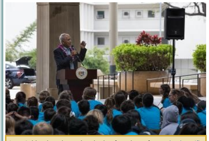
Sen. Gabbard spoke to hundreds of students from <u>Island Pacific Academy</u> at the State Capitol for Blue Planet Foundation's Clean Energy Day on April 20.

On April 20, I spoke to over 600 students gathered at the State Capitol for Clean Energy Day. Their energy was electric! (pun intended) I thanked the students for their interest and commitment to clean energy transportation and their enthusiasm in helping reach the state's goal of 100% renewable energy by 2045. I also updated the students on the state's progress toward that goal: 26% renewable energy this year, up from 9% renewable energy in 2009. The event was hosted by Blue Planet Foundation and featured activities and displays on clean and renewable energy technologies. One of the highlights of the event: a display and test drive of several different electric vehicles. I've been driving an electric vehicle – a Nissan Leaf – since 2011, but couldn't resist checking out the newest line of vehicles.