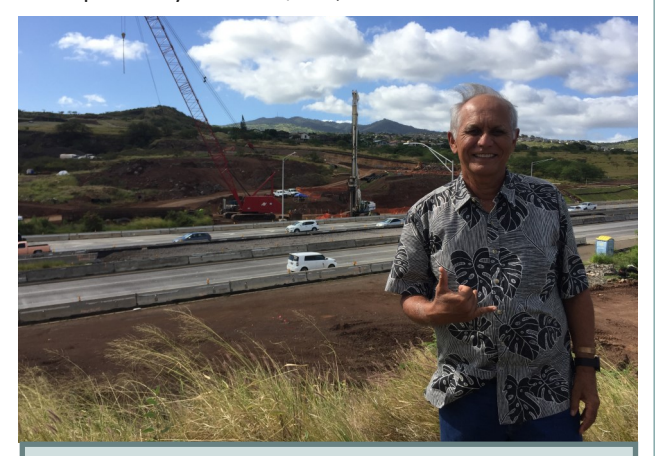
Sen. Gabbard has been working with other Kapolei area legislators, the Department of Transportation, and the James Campbell Company to make sure Phase 2 of the Kapolei Interchange project stays on track.