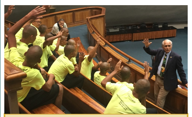
Sen. Gabbard spoke to cadets of the Youth Challenge Academy during their tour of the Hawai'i State Capitol February 13.