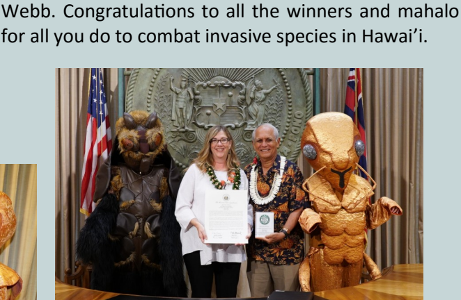
Sen. Gabbard presented the O'ahu MVP 2017 award to Sandy Webb at the Hawai'i Invasive Species Council award ceremony on March 10.

Sen. English and Sen. Gabbard challenge the mascots of the Hawai'i Invasive Species Council: the Coconut Rhinoceros Beetle and the Little Fire Ant.