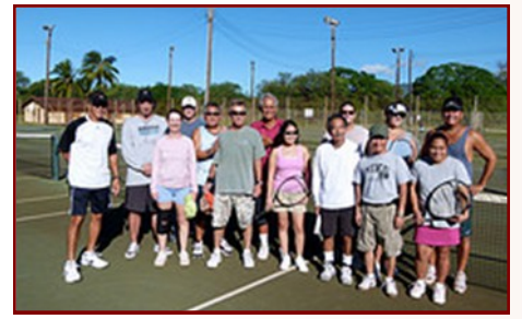
Kalaeloa Tennis Association Work Party January 2011

Our district was very fortunate to be the only one in the state to receive $40 million in construction funding for a new school in the 2012-2013 budget. This will make a big difference for our already overcrowded schools. Kapolei Il Elementary will be located adjacent to DR Horton Schuler Division's Mehana residential project off Ft. Barrette Road. across the street from Kapolei High School. In 2009, we appropriated $3.5 million for the design of the school, which Governor Abercrombie is expected to release soon. These funds will allow the Department of Education (DOE) to begin the process of selecting a consultant, who will head up the planning and design of the new school. The DOE will also be working with the Leeward Oahu District Complex on the "visioning process" to determine what the school will look like. We are hoping for a 2015 completion date.