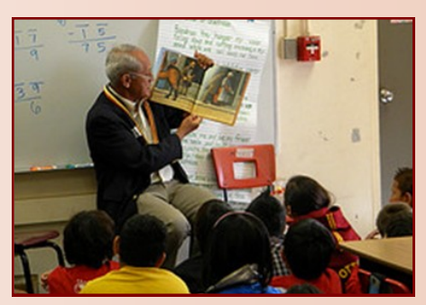
Read Across America Mauka Lani Elementary March 2011