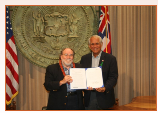
SB 704 Signed into Law April 2011