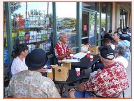
Waikele Listen Story Meeting November 2010