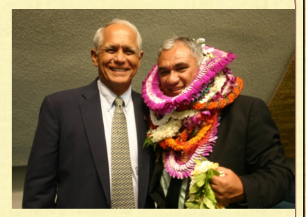
Senator Gabbard congratulated Bill Aila for being unanimously confirmed as the Chairman of the Department of Land and Natural Resources by the Senate on March 3.