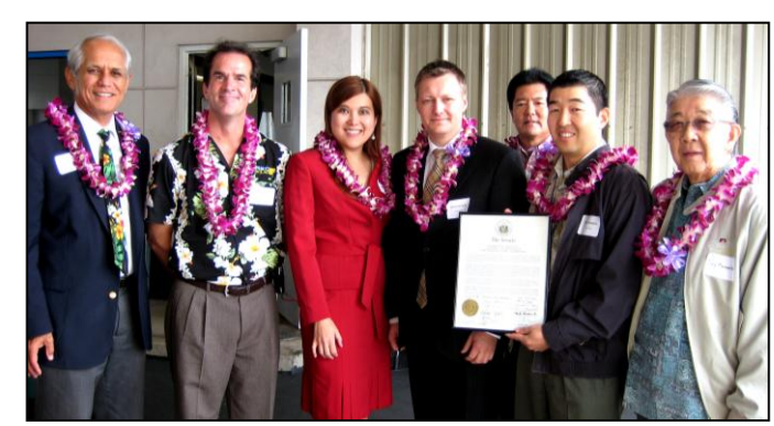
Sen. Gabbard honored Waipio's Tony Group Autoplex on February 23rd upon the blessing ceremony for a 298 kW solar electric system by REC Solar, which powers all 3 dealerships.

SB 1671 would align our energy policy with a clean energy and sustainable future by prohibiting new or expanded fossil fuel power plants beginning July 1, 2009. There would be an exemption for fossil-fuel based