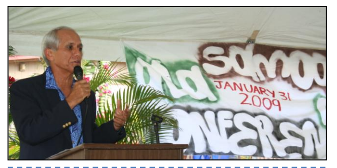
Sen. Gabbard addressed the audience at UH West Oahu's "Samoa Ala Mai Conference" on Saturday January 31, 2009.