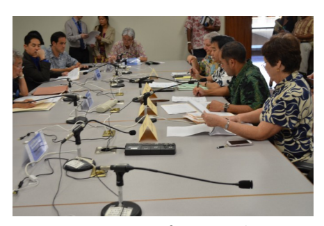
Senator meeting in conference with House members to come to an agreement on certain bills.