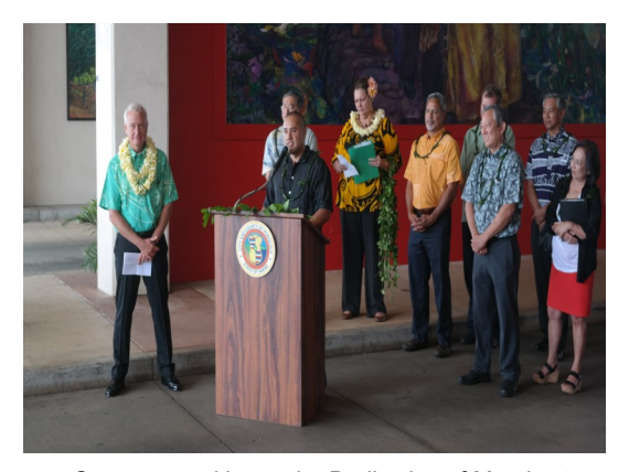
Senator speaking at the Dedication of Murals at the Wahiawa Transit Center.