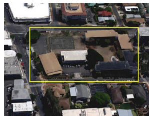
3633 Waialae Avenue