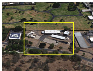
Diamond Head Road

For more information, please email doe_info@hawaii DOE.org or call 808-586-3230.