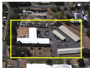
22 nd Avenue