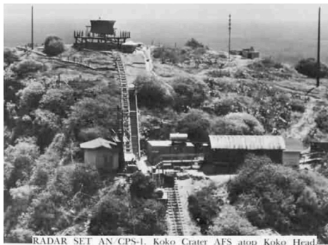
RADAR SET AN CPS-1, Koko Crater AFS atop Koko Head.

The Kokonut Koalition is a growing group of hikers of the Koko Crater Trail and others who are concerned about the trail's long-term prospects. We have organized in an effort to convince the City and County of Honolulu and perhaps the State to take active measures to preserve and improve this unique asset.