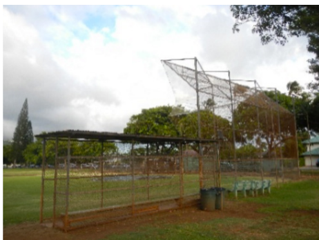
Kāhala Community Park, before reconstruction

The City and County of Honolulu's reconstruction project to improve the primary baseball field at Kāhala Community Park is now complete and open to the public. The project began last October, during which the baseball field remained closed while the rest of the park remained open to the public. The project included removing and replacing the backstops and dugouts, the installation of new fencing and sidewalks, landscaping, and the planting of new grass. The project cost $649,000 to complete and was contracted out to Site Engineering, Inc.