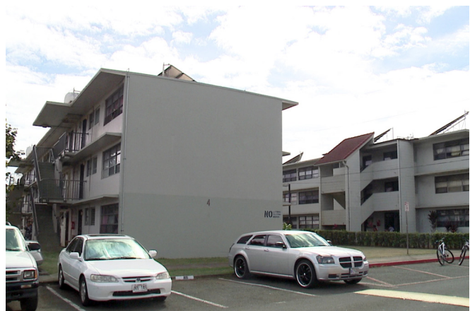
Mayor Wright Housing in Palama KHON2