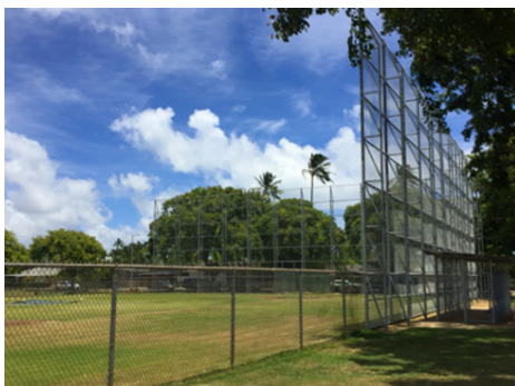
Kāhala Community Park, after reconstruction