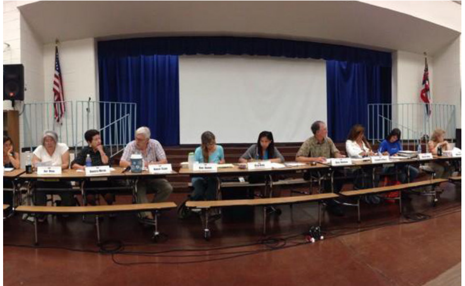
A meeting of the Hawaii Kai Neighborhood Board. Get involved in your Neighborhood Board this year.